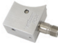
VZFG BX Focus block For Canon 16x XL Series Manual Lenses