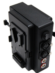
VZCP-24VR 24V portable power station for CinemaPro line