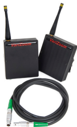
VZCP-T30 Allows for wireless operation between CinemaPro Head and Full function remote for up to 1 Mile line of sight.