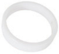
VZTOC-RING Ring for VZTOC