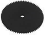
VZEFCU-G32.8 VZEFC-U gear