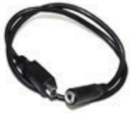
VZAV/LANC Mini Audio/Video to LANC Converter Cable for SONY Handycams