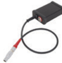
VZTOC-24VR 24 volt Regulator for TOC receivers (accepts 9-36VDC outputs 24VDC for consistent motor speed)