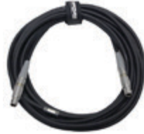
VZTOC-CTRL 20' control cable for connecting TOC hand unit to Receiver in wired mode, or for connecting TOC hand unit to CP console in wired repeatable mode.