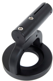
VZCP-T35 Adapts Mitchell mount to Jimmy Jib style mount