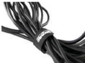
VZS12 12" Velcro cable straps 8 ct