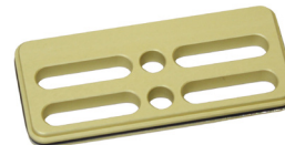
VZCP-T24 1/4 Offset Plate Nodal line offset insert plate