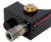
VZFG BF Focus gear box for Fujinon