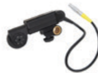
VZTOC-LDM Single lens drive motor system for TOC w/ Motor, Rod Clamp (15mm/19mm), and universal gear set.