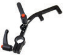
VZEFCU-ADAPTER This bracket system allows you to adapt your existing EFC system to work with any lens by mounting the motor to this new bracket that can clamp to any 15/19mm matte box rods.