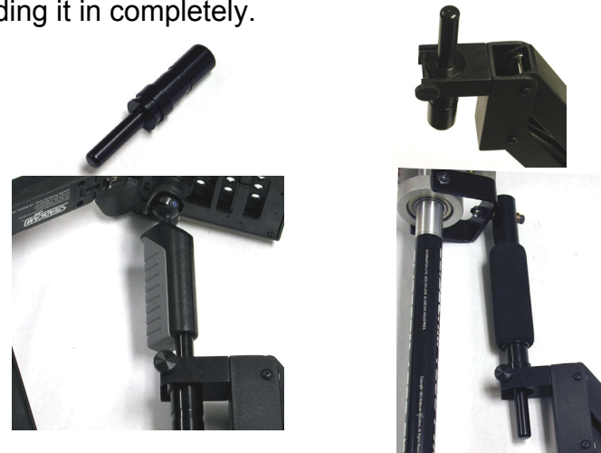
Steadicam Jr.® mounted on post

***If you will be using a Steadicam Jr.® or Glidecam® handheld stabilizer, you will need to replace the spool with the adapter post. Figure out which end fits into the bottom of your handle and then insert the adapter post into the yoke with the correct end facing up. Replace the retaining screw, threading it in completely.