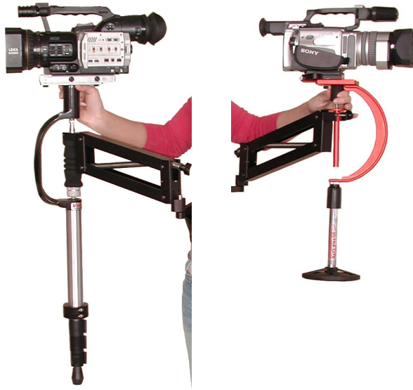
DV Sportster shown with VariZoom FlowPod and UltraLite

Although it is fairly easy to set up the DV Sportster, you must know how to use the handheld stabilizer before you get started , so read the instructions for the handheld unit first, if necessary. Operating the full system smoothly will require practice.