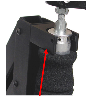
Finish by replacing the retaining screw

**If you will be using it with a FlowPod, you will need to remove the spool adapter from the yoke by unthreading the retaining screw and sliding the spool out (save it just in case). Then push the foam grip of the FlowPod down at least 1.5", accordion style, so that the groove on the handle will slide into the yoke (don't fold or roll the foam grip – it might tear). Finish by replacing the retaining screw, threading it in completely.