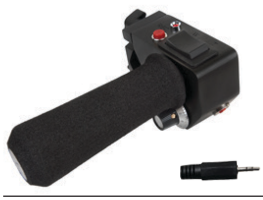
Recommended Extension Cables