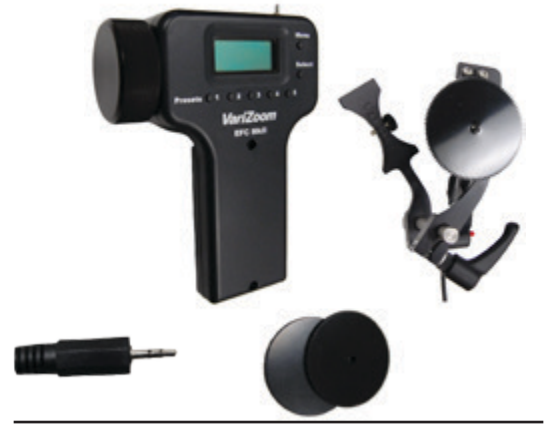
Recommended Extension Cables