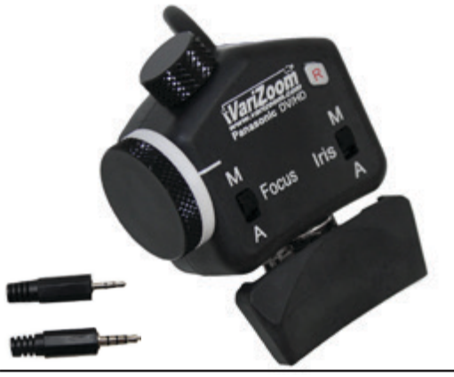
Recommended Extension Cables