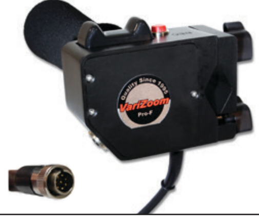
Recommended Extension Cables