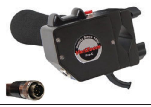
Recommended Extension Cables