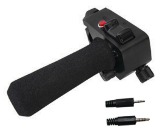
Recommended Extension Cables