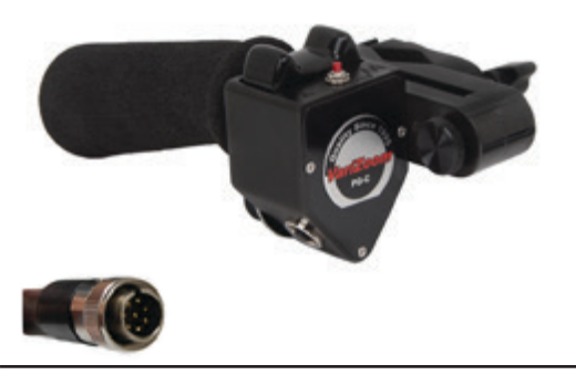
Recommended Extension Cables