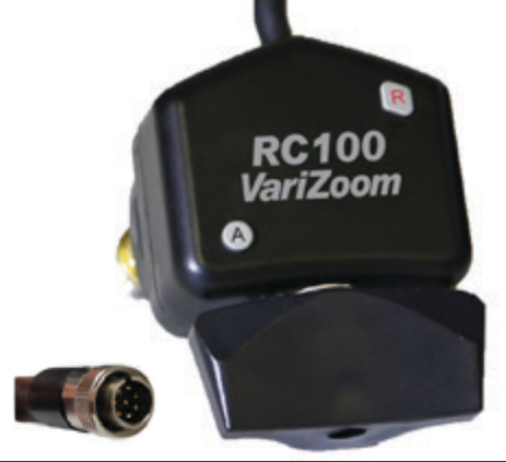
Recommended Extension Cables