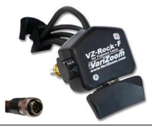
Recommended Extension Cables