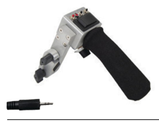
Recommended Extension Cables