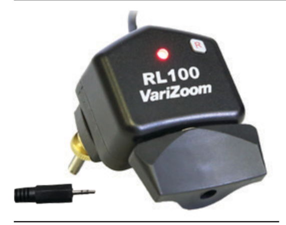
Recommended Extension Cables