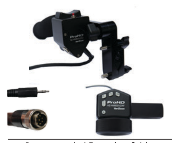
Recommended Extension Cables