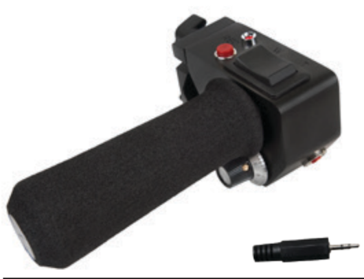
Recommended Extension Cables