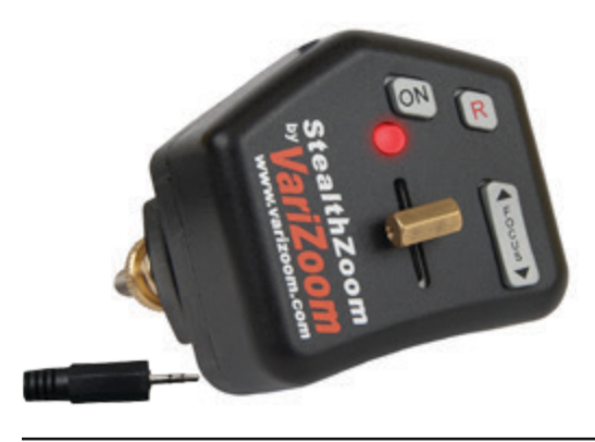
Recommended Extension Cables