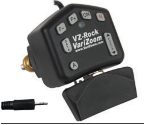
Recommended Extension Cables