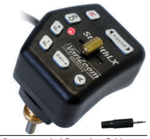
Recommended Extension Cables

The RL100 LANC lens camera zoom control offers a smooth widesweep rocker for excellent control over variable-speed zoom on any camera equipped with a LANC Remote port. The ability to zoom from the tripod handle improves the operator's ability to seamlessly and smoothly capture images, and the RL100 offers reliable, precise control for a great price. The RL100 also features a record button and LED indicator light that glows when your camera is in record mode and flashes when your battery is low. It fits on just about any tripod handle, shoulder rig, or jib and it can be extended with our 10, 20, 50 or 100 foot cables. Includes VariZoom's no-hassle 2 year warranty and the peace of mind that comes with owning a controller from the industry leader.