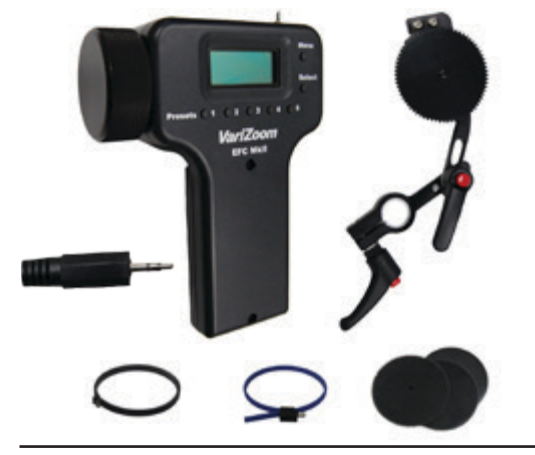
Recommended Extension Cables