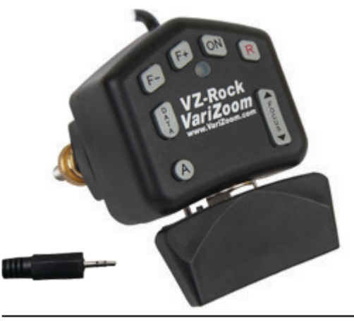
Recommended Extension Cables