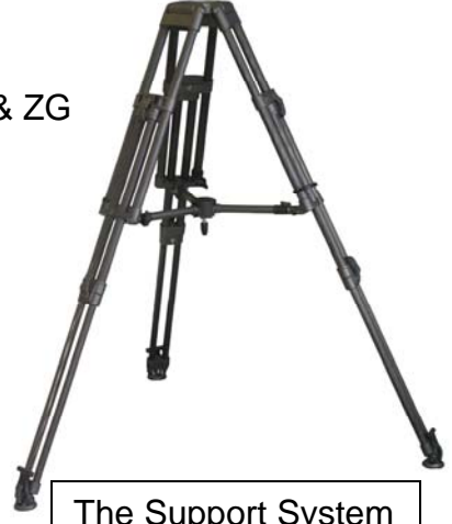
The Support System